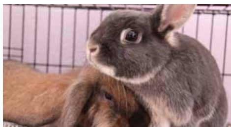
Bruce with his wife Womble

Bruce was bonded with three wives before he found true love with the gorgeous Womble. We had to warn his new owner that it probably wouldn't work, but he proved us wrong and fell ears over tail in love with Womble and his new mum and dad love him hugely.