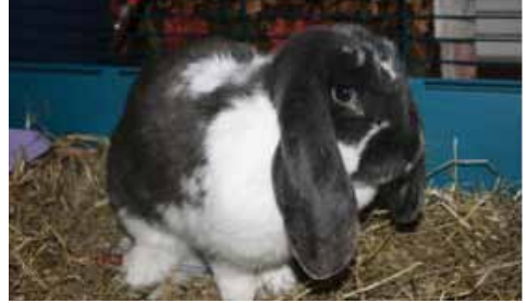
Bluebell in her new home