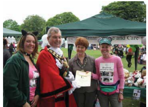
Meeting the Mayor