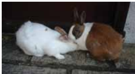
Timmy getting a clean from Ginger

We are also delighted that some of our longer term foster buns were rehomed this summer. Timmy had been with us for over a year – he was quite hutch territorial when he arrived, but loved being with other bunnies, he outlived two wives while with us. But he has now found love with Ginger and lives with her as a house bunny.