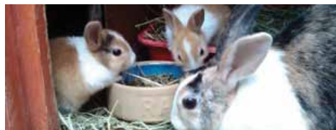
Cupcake and her babies

Billy and Barney always seemed to be overlooked, until a lovely family from Kew came along and felt they were the bunnies for them. Billy & Barney now have a great life with a family who give them all the care and attention they need . . . and they get to come and play and explore in the house.