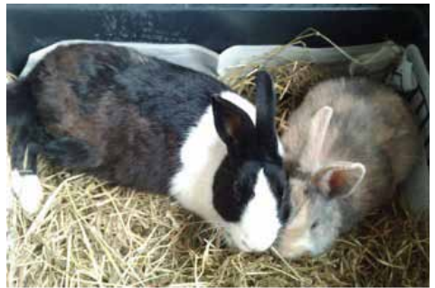
Zebedee and Buttercup together

Zebedee and Buttercup were both ARC bunnies, and Zebedee was one of the Ealing Eleven. Their new family said, "Just wanted to let you know that Zebedee and Buttercup have settled into their new home really well! They love exploring and hopping about from inside to outside and back again - they're both very friendly and always seem pleased to see us! The girls have had a lovely weekend with them - they have been having their breakfast in the little house with them in the morning! You're very welcome to pop in and see them whenever you want and many thanks for all your help."