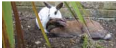
Tiffany with Pekoe