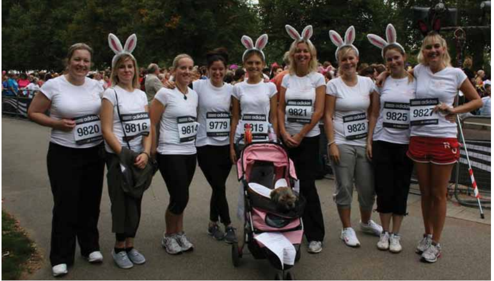
Photo of Twickenham Vets at the Adidas Fun Run

Here is a picture of the girls at Twickenham vets during the 5k Adidas fun run. They raised £900 for Animal Rescue and Care, and Rescue Remedies. The day was very successful and everyone at ARC thanks them for their help and contribution.